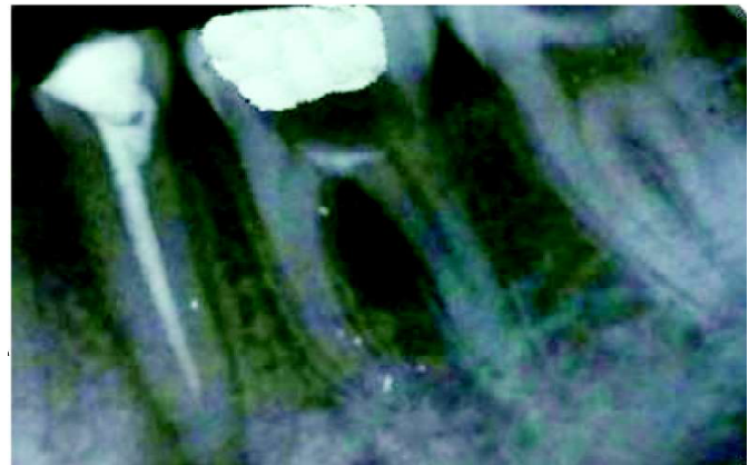
Figure 1 MTA placed in furcation area