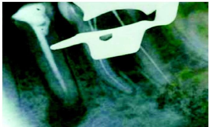
Figure 2 Working length determination