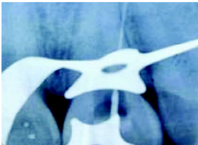
Figure 1 Perforation on labial surface of central incisor