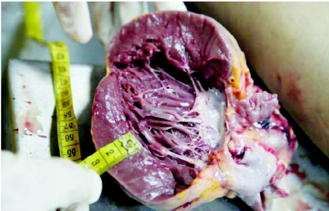
Figure 2 Left Ventricular hypertrophy

Rupture was present in Postero-lateral wall of ascending aorta just away from its origin ( Figure3 ). Hyperemic area was present around the rupture site. Multiple petechiae were present over the Epicardial surface of the ventricles.