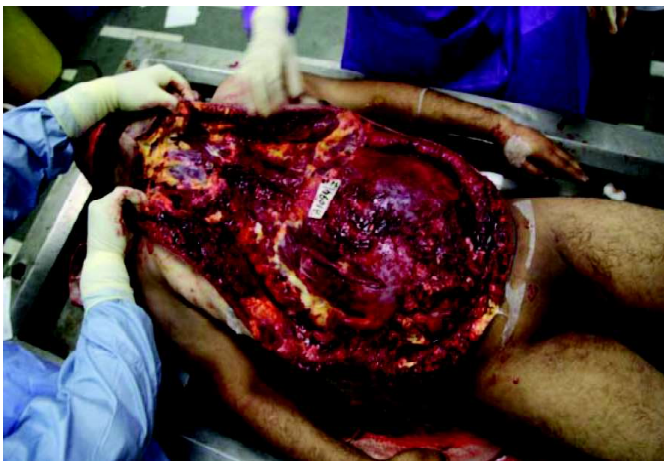
Figure 2 Subcutaneous fat of thoracic and peritoneal cavity was turned into hemorrhagic and fibrotic mass

Subcutaneous fat of thoracic and peritoneal cavity was turned into hemorrhagic and fibrotic mass (Figure-2). Liver was enlarged, with hepatic steatosis. Heart showed 90% stenosis of left anterior descending and right circumflex artery along