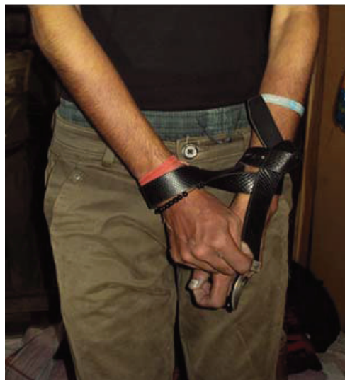
Figure 2 Loosely tied wrists with leather belt and cobwebs sticking on the palm

leather belt on the anterior aspect of the body tied both his wrists. The right wrist was tied in a single loop and his left wrist was tied in a double loop without any knot which can be separated easily ( Figure 2 ). There were no injuries present underneath the knot ( Figure 3 ). The ligature mark, brownish in colour, grooved, non-continuous, and hard like parchment and having a maximum width of 03 cm was present obliquely and incompletely around the neck. The mark was situated 2.8cm below the tip of right mastoid process, 05 cm below the chin, 10 cm above the suprasternal notch and 04 cm below the tip of left mastoid process. On dissection of the neck, the underlying subcutaneous tissue was found pale and glistening with no extravasation of blood and with intact cartilages ( Figure 4 ).