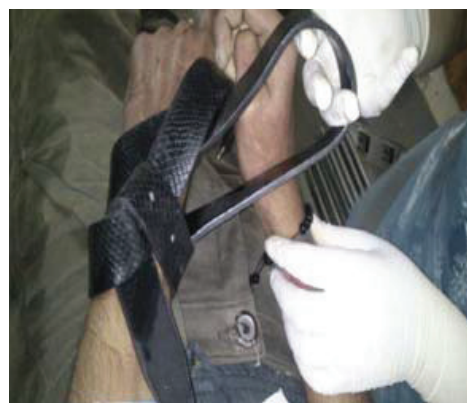
Figure 3 Showing wrists tied loosely in simple loop with no underlying injuries