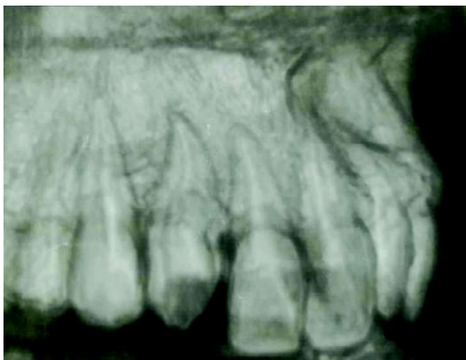
Figure 2 Pre-operative CBCT Image