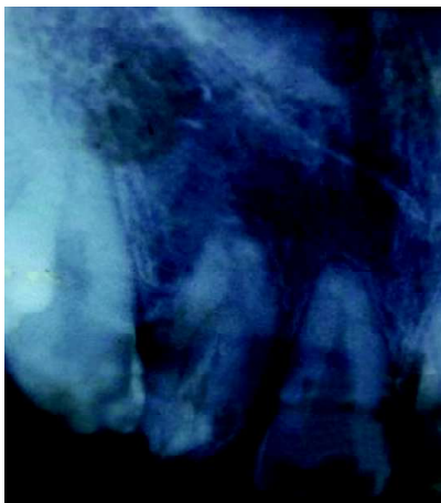
Figure 1 Pre-operative Radiograph

Radiographic report showed a radiopaque structure within the crown of 12, crossing the cemento-enamel junction and extending upto the middle third of the tooth. Widening of periodontal ligament was noticed ( Figure 1 ). CBCT showed increased radiodensity similar to enamel within the canal wall in the palatal aspect due to the presence of type II DI which terminated in the middle third of the root canal ( Figure 2 ). It revealed two pulpal areas, one central invaginated structure and a larger pulp space surrounding the central structure on all sides within the root canal ( Figure 3 ). A single canal, approximately 5.4 mm going beyond the DI was seen.