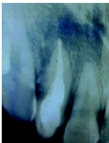
Figure 5 Post-operative radiograph