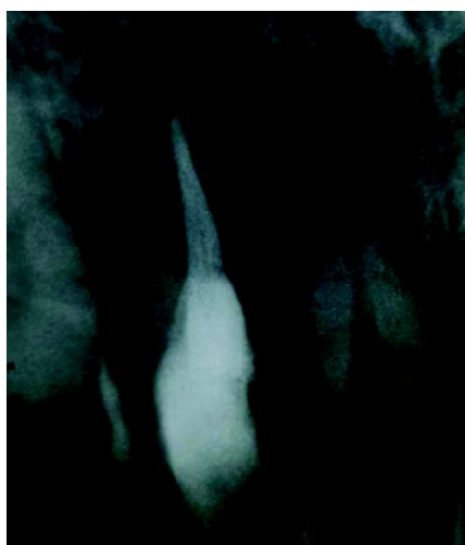
Figure 6 Three months follow-up radiograph