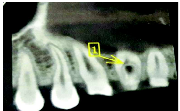
Figure 3 CBCT image showing central anomalous structure surrounded by pulp

A diagnosis of chronic apical periodontitis was made based on the above findings. Root canal treatment followed by post endodontic restoration was planned. The clinical condition was explained and treatment consent was taken from the patient.