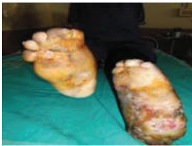
Figure 1 Large areas of planter erosions and ulceroproliferative lesions over both feet (more on left than right) with foot deformity with shorten digits. Ulcer on the left posterior part of sole irregular, ill-defined with hyperkeratotic crusted margins and floor showing dirty slough and unhealthy granulation tissue

tomography scan of the pelvis and abdomen showed para aortic and external inguinal node involvement compressing the right external iliac veins with luminal thrombus. The acute presentation led to the patient being treated on the lines of chronic trophic ulcers. In this patient, the possibility of immunocompromise leading to the rapid malignant transformation cannot be overlooked.